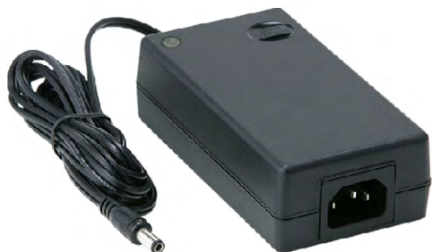
2.56"W x 4.65"L x 1.58"H